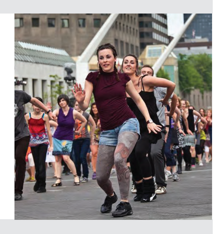
Bringing the arts to life De l'art plein la vie