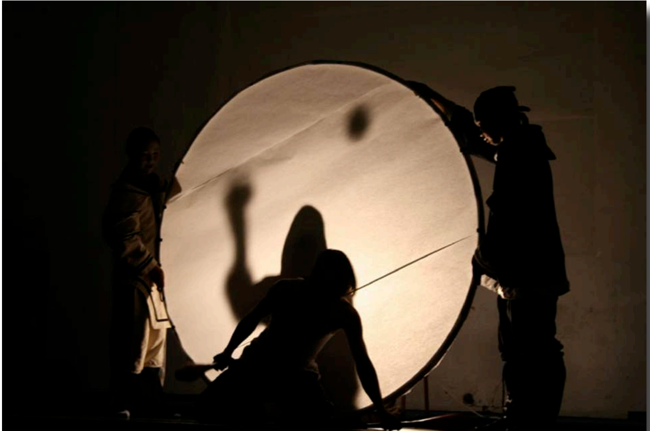
Oaraya by Art Cirq.