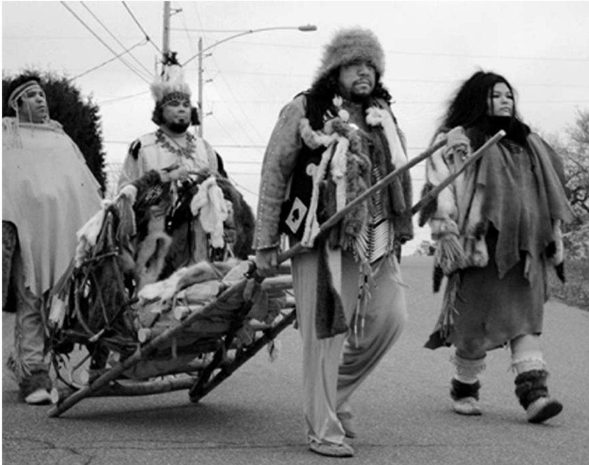
Global Savages by Debajehmujig Theatre.