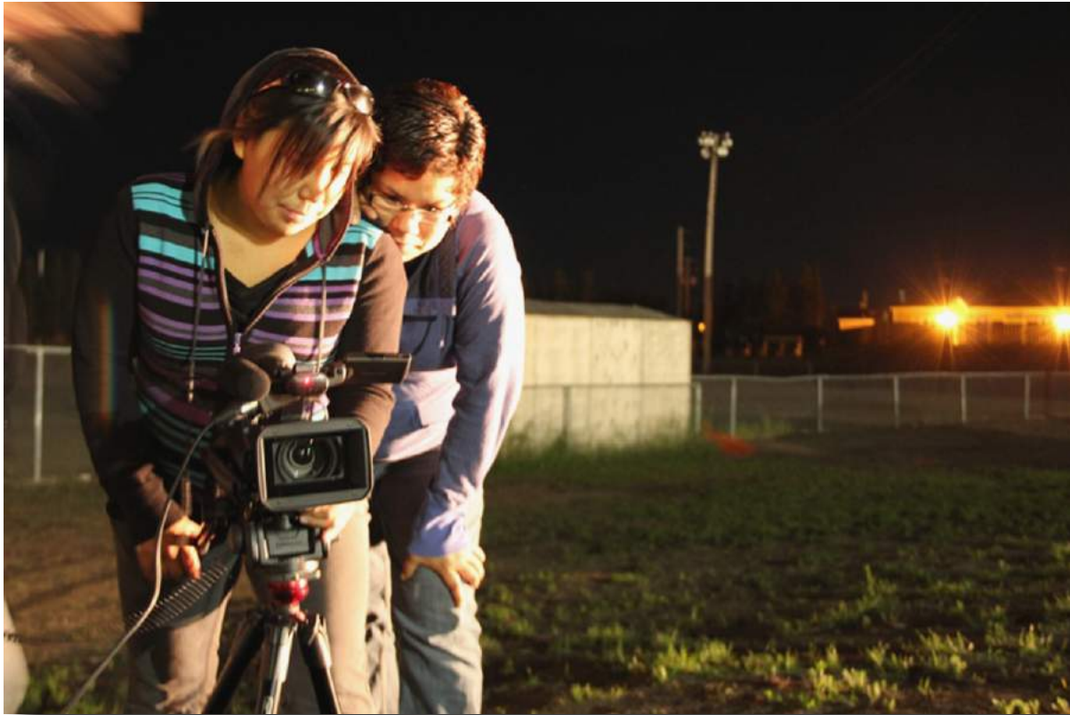
Shooting of Journal d'un Sevrage, Wapikoni mobile.

Indigenous people in Quebec...are still calling for justice, and hip-hop is a vehicle to call for this change. As an artist, I love hip-hop because it allows for free expression: You can talk about whatever issues are important to you. Hip-hop is a space for me to express myself on many subjects, to denounce injustices. It's also a space to propose positive solutions for social ills, and to reflect on the world around me. Through hip-hop we are opening people's eyes to our culture and also to our long, long history on this land. I want to speak to youth in Quebec who don't always learn about real Indigenous history in the school system. Quebecois and Indigenous peoples' history in Quebec are interlinked. This relationship between our cultures has shaped what we know to be Quebec today, and who we are. (Samian) 36