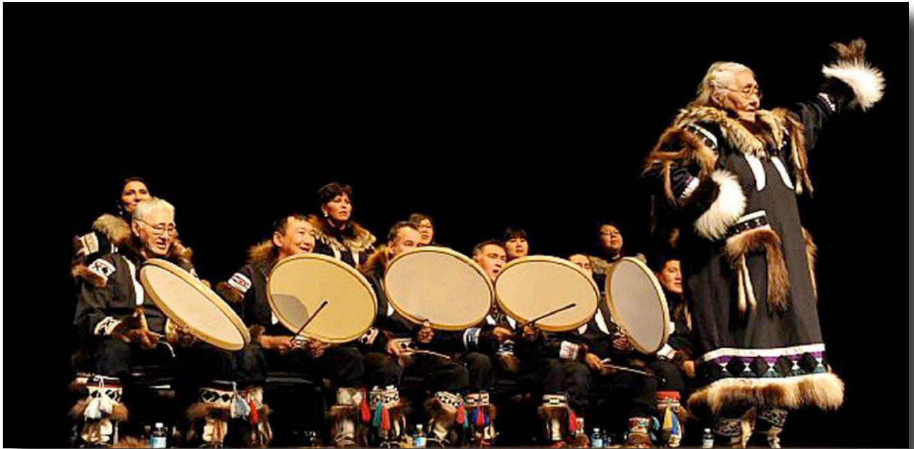
Inuvialuit Drummers and Dancers, Inuvik.

My hope is that the work that so many of our people are engaged in now, to restore some of these practices, to incorporate our knowledge and to recover the knowledge and philosophy and the ethics in a contemporary life way that makes sense and restores the stewardship, restores the community, restores the bonding that we have with our land that has been severed for many years.