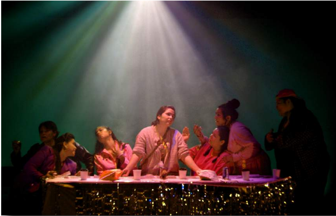
The Rez Sisters by Tomson Highway, Centre for Indigenous Theatre.