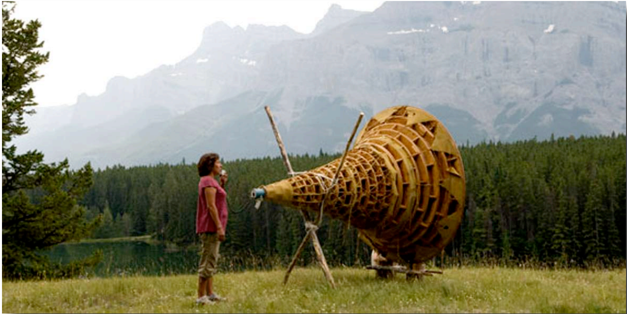
Ayum-ee-aawach Oomama-mowan by Rebecca Belmore.