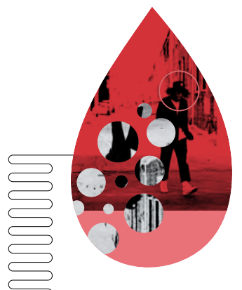
Seed Grant SMALL-SCALE GRANT To prepare, experiment, plan, explore, develop.