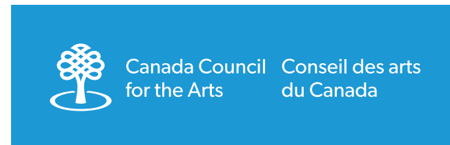
White on dark coloured background