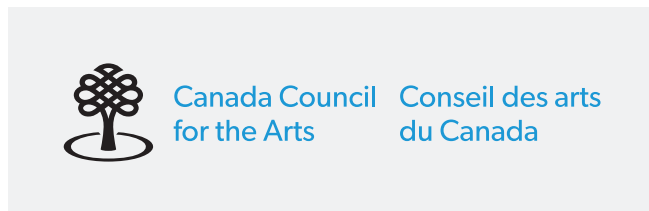
On a light background