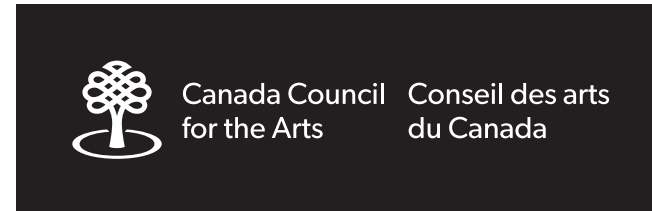
White on black background