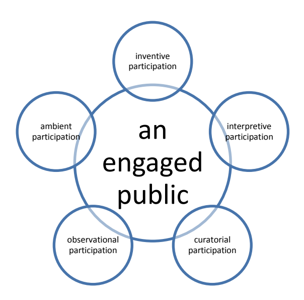
Figure 1 – A model of arts participation

As an example of the complexity of mapping funder interventions in the stimulation of arts engagement, arts education could arguably be an intervention in every mode. Through the regular curriculum and extra-curricular activities, children and youth: